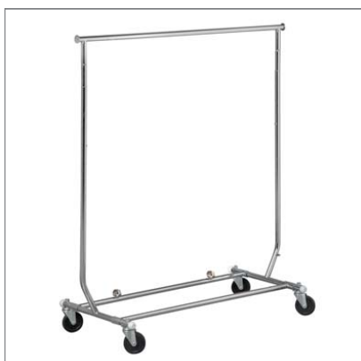
Slick Rail MR 1 - 1.4